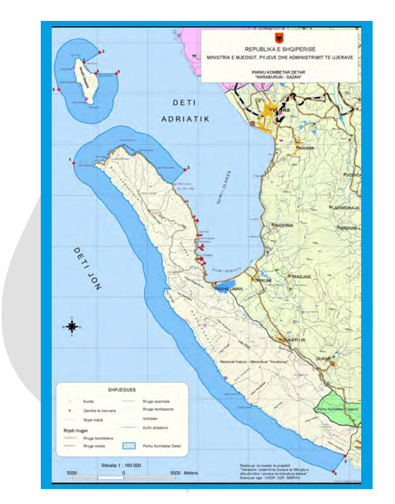
MAP2 - MAP of Marine Protected Area "Karaburun-Sazan - Vlora bay

14.5. Regarding COVID, everyone has to follow the local Government rules that will apply. Nevertheless, the organization will provide a specific document for the event regarding the pandemic situation at the time.