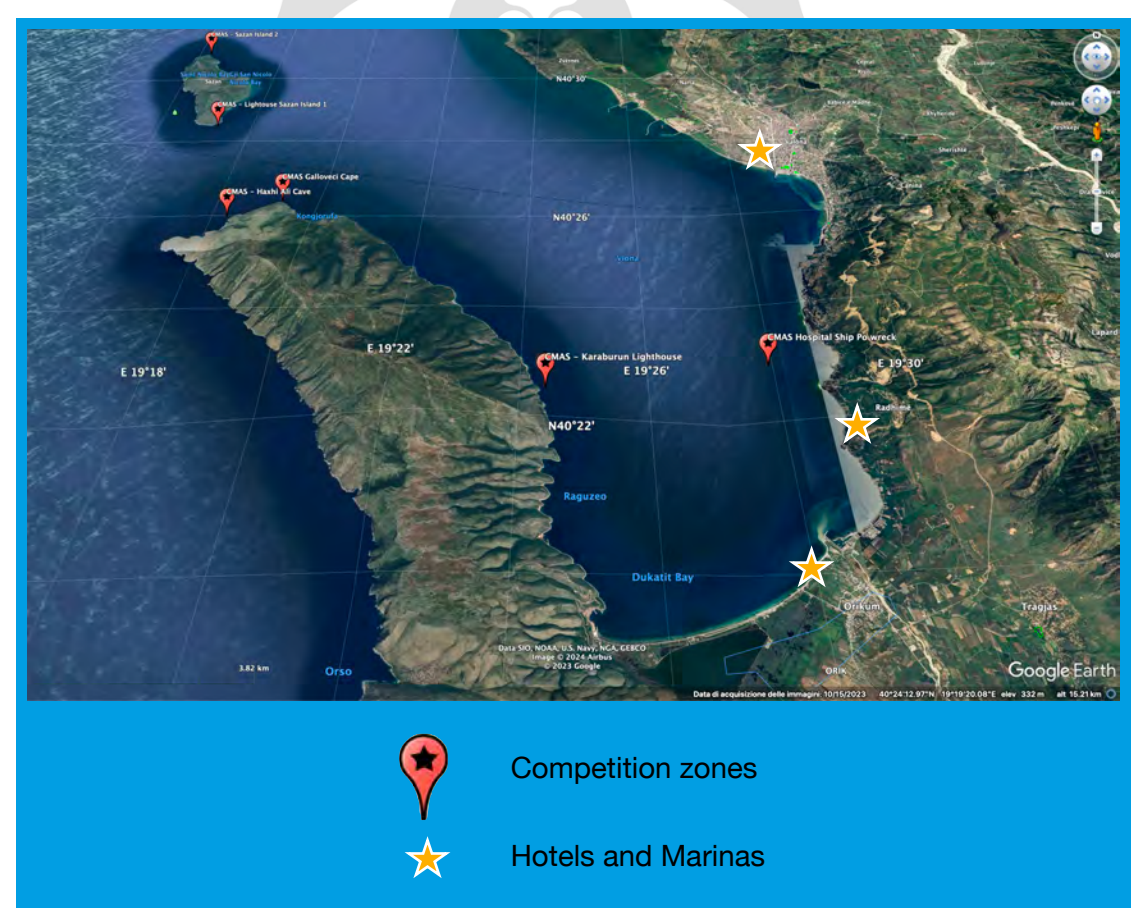
MAP 1 - Identification of the competition zones (both main, both reserve) - Vlora bay, Vlora (Albania)